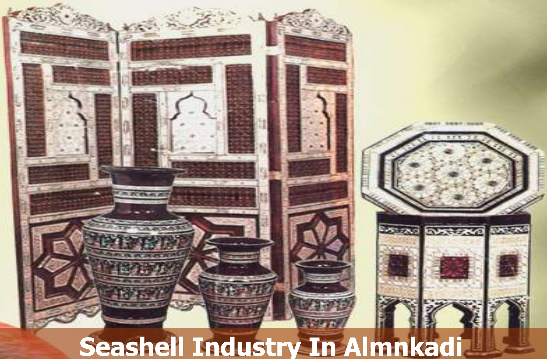
Seashell Industry In Almnkadi