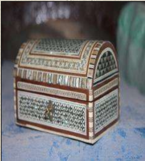
Seashell Industry In Almnkadi