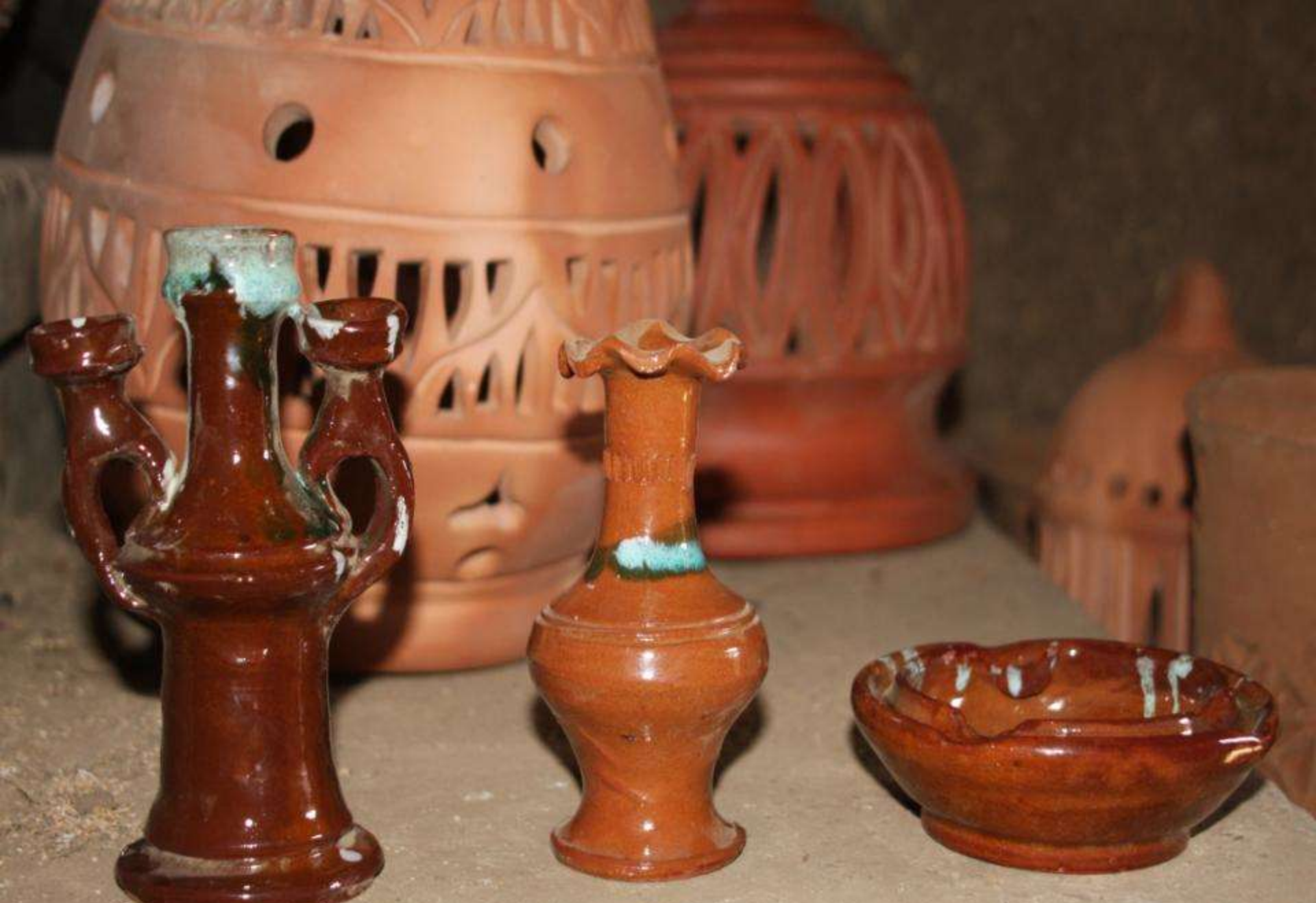
Pottery items made in Grace, Ashmoon