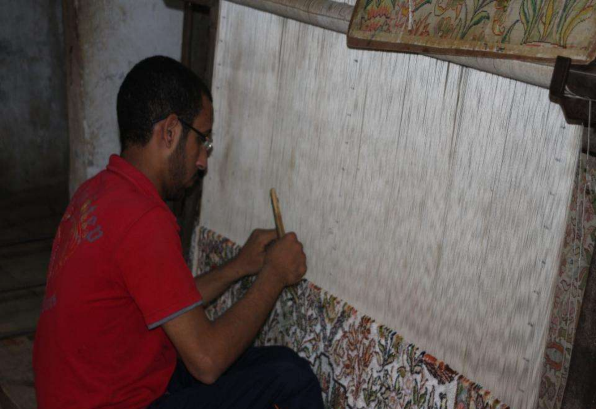
A craftsman is making a silk carpet in Abu Sha'raa Village