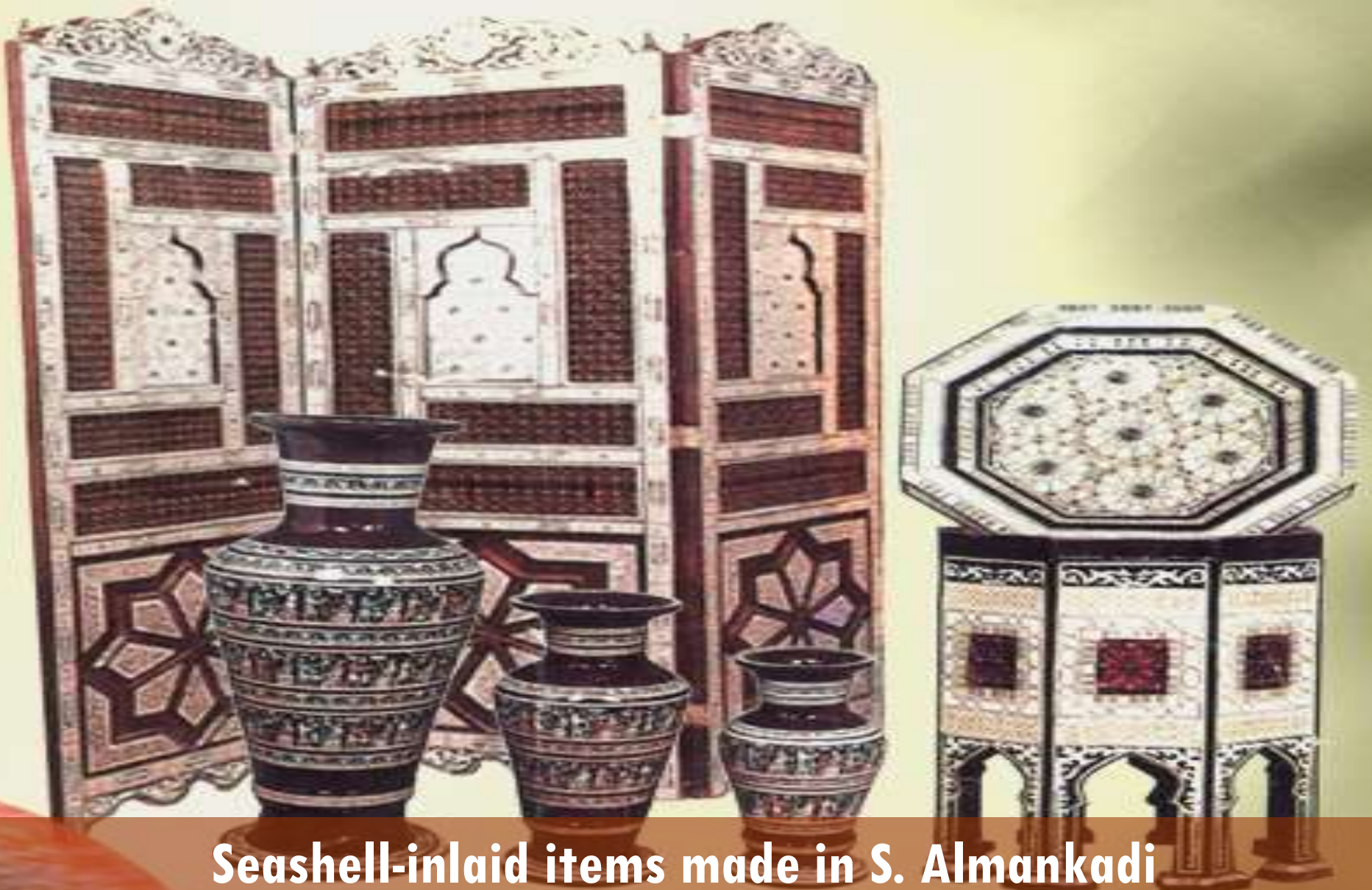
Seashell-inlaid items made in S. Almkadi